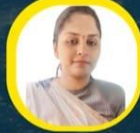
SPOORTI SAKRI AC (CT) 1st Rank