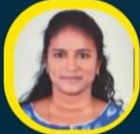
CHETHANA Y TAHASILADR